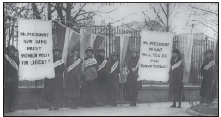
The first picket line at the White House February, 1917

Jane Addams Why Women Should Vote , 1915