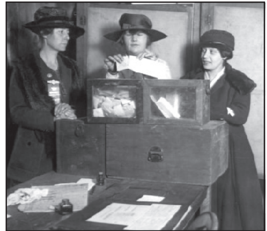
Women at the Ballot Box New York, 1917

"If woman would fulfill her traditional responsibility to her own children; if she would educate and protect from danger factory children who must find their recreation on the street; if she would bring the cultural forces to bear upon our materialistic civilization; and if she would do it all with the dignity and directness fitting one who carries on her immemorial duties, then she must bring herself to the use of the ballot - that latest implement for self-government."