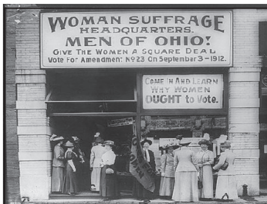
Women's Suffrage Headquarters in Upper Euclid Avenue, Cleveland

"Because it is fair and right that those who must obey the laws should have a voice in making them...and because it is the quietest, easiest, most dignified and least conspicuous way of influencing public affairs."