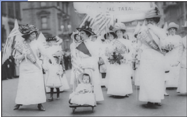
New York Suffrage March May 6, 1912