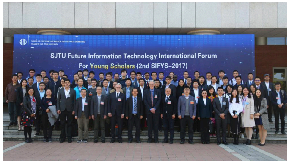
2nd SJTU Future Information Technology International Forum