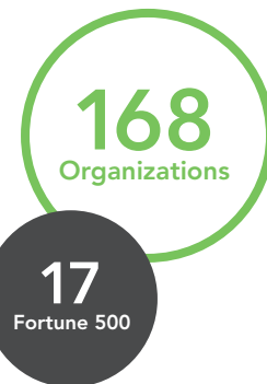
ABB - Dodge Abercrombie & Fitch Acadia Lead Management Services ACCO Brands Adams Robinson Construction AIDA-America Corporation Air Force Institute of Technology Air Force Life Cycle Management Center Engineering Directorate (AFLCMC/EN)