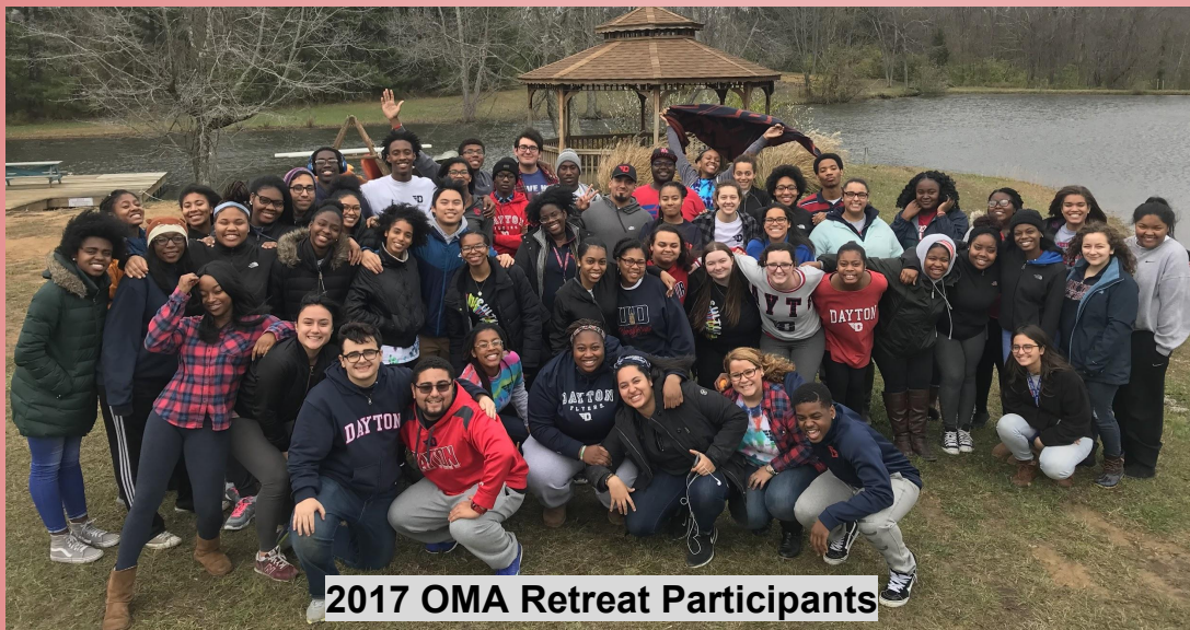
2017 OMA Retreat Participants